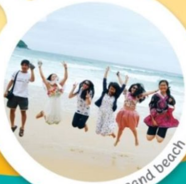
White sand beach