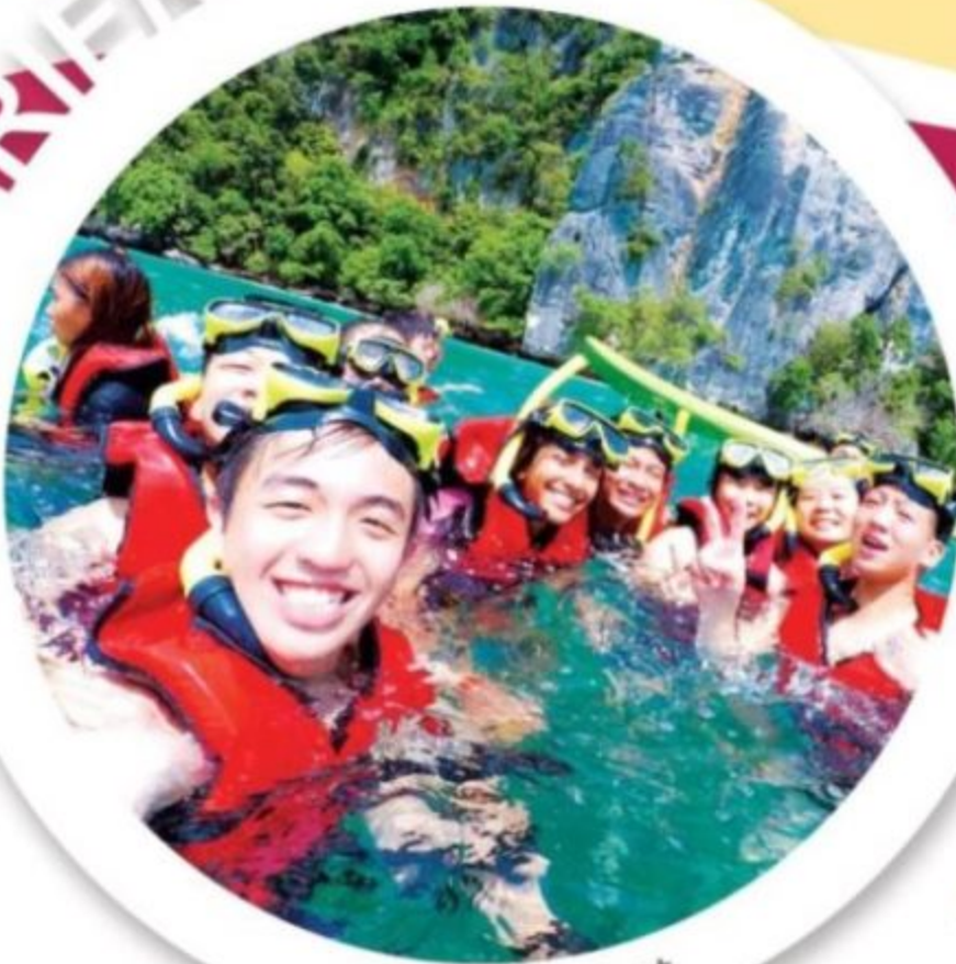
Trip to Phuket