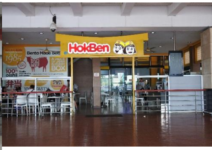
Meeting Point Terminal 2