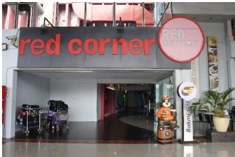
Meeting Point Terminal 2

Notes: Our pick up team will wait at designated position, wearing University of Indonesia yellow jacket and bringing 'ASEA UNINET Indonesian Chapter Workshop' standing banner.